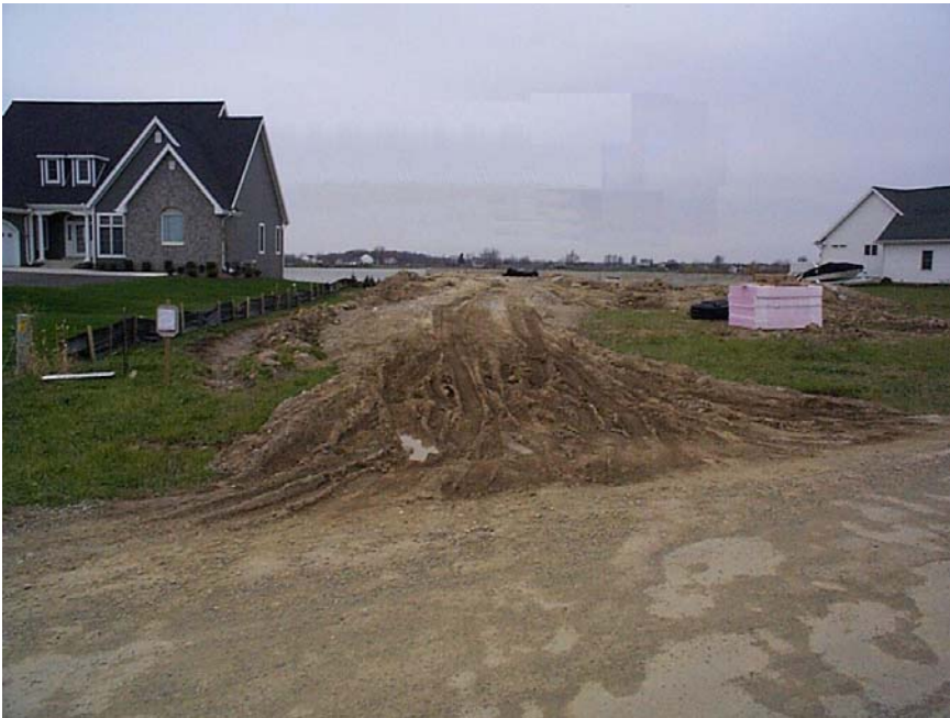
NOT ACCEPTABLE ACCESS DRIVE