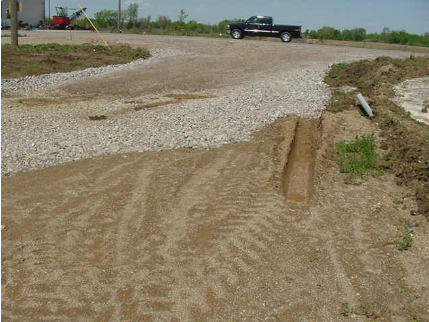
ACCEPTABLE STONE ACCESS DRIVE