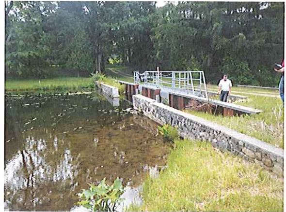
Upstream Side of Structure