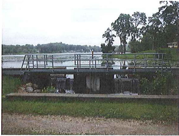
Downstream Side of Structure